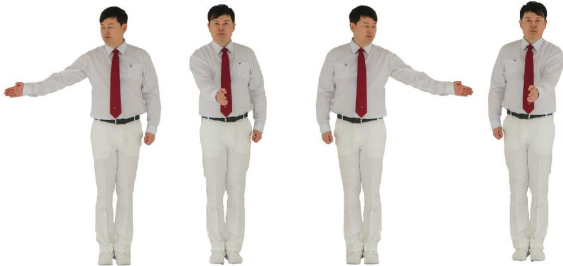
(PSS test mode, if need)